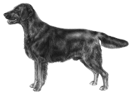
Flat-Coated Retriever Sibling breed