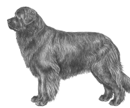
Newfoundland Cousin breed