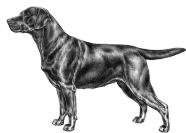
Labrador Retriever Sibling breed