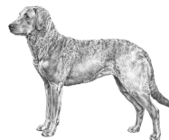
Chesapeake Bay Retriever Cousin breed